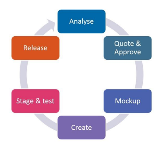
Report Development Life Cycle

The central element of the work process for this service revolves around the creation and approval of a report template and a requirements specification which is completed prior to the development. The specification includes details such as the output format and the specific reporting technology to be used.